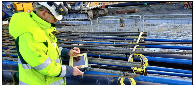
Image 3. Thermal Integrity Profiling for Mass Concrete

The American Concrete Institute (ACI) identifies mass concrete as concrete volumes large enough to be subject to temperature gradient induced cracking. As such, many designers consider drilled shafts with diameters greater than 4.5 to 6 ft (1.4 to 1.8 m) falling in the mass concrete category. In these conditions, the primary concern is the temperature differential between the center of the drilled shaft and the outer edges, as well as the maximum concrete temperature achieved during curing.