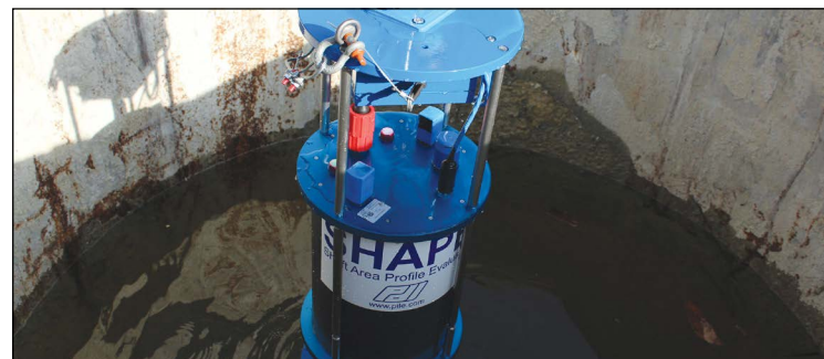
Image 1. Shaft Area Profile Evaluator (SHAPE) descending into drilled shaft

SHAPE provided testing of approximately 400 drilled shafts at a new interchange project in Houston, TX. The shafts ranged in diameter from 36 to 96 in (1 to 2.4 m) with lengths up to 105 ft (32 m). Project specifications required that the verticality of the drilled shafts be verified, and that the shafts be installed to a tolerance of 1 in (25 mm) of centroid deviation for every 10 ft (3.5 m) of drilled shaft length, or 0.83%. This requirement is more demanding than normally specified and required coordination between the drilled shaft contractor and onsite GRL personnel who performed the SHAPE tests and assessed the compliance of the shaft verticality with project specifications. Approximately 10% of the shafts required re-drilling to bring the shafts into compliance. Typically, the time required for SHAPE testing and result presentation was less than 20 minutes.