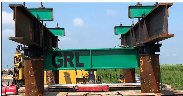
Image 5. Static load testing performed in Texas

For many years PDI has offered a SLT measurement system which automatically recorded measurements from dial gages, jack pressure sensors, load cells and shaft internal strain gauges. PDI's recently expanded SLT main unit is now attached to data acquisition boxes that transmit data automatically at selected time intervals. Each data acquisition box can support up to 16 channels of data and multiple boxes can be daisy chained to expand the number of channels. The sensors are quickly and easily connected to the acquisition box(es) via smart universal inputs which automatically read the sensor calibrations. This system keeps the test engineer in a safe place away