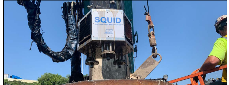
Image 2. Shaft Quantitative Inspection Device (SQUID) descending from drilled shaft

The end bearing resistance of the BDSLT and SQUID penetrometer resistances have been compared to establish a correlation between static load test results and the predicted end bearing of the SQUID. Early indications are that a relationship can be developed based upon these results making SQUID results suitable for either assessing or confirming the desired end bearing.