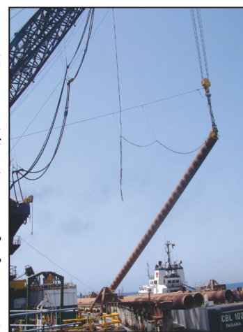
Pile being lifted - offshore oil platform in the Persian Gulf