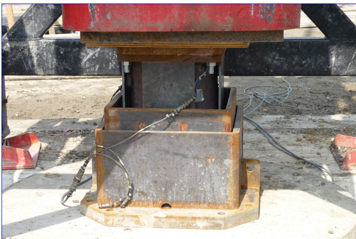
Figure 1: Load cell and cushion system on shaft top

A complete test system consists of the APPLE loading device, a Pile Driving Analyzer® (PDA) and GRL's test team. The APPLE frame supports the drop weight and the frame guides the falling ram after a hydraulic clamp releases it. The traditional PDA instrumentation of 4 each strain and acceleration sensors, attached to the pile top, measure impact force and pile motion which the PDA transforms to bearing capacity, stress and energy values. Modified systems determine the pile top force directly