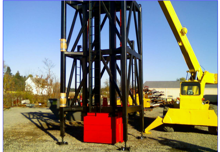
Figure 2: GRL's self-elevating 16-ton device

either with the F=ma approach or using a load cell. The former measures the ram deceleration, which when multiplied with the ram mass provides the impact force according to Newton's Second Law. The load cell force measurement is useful for drilled shafts where a high quality concrete extension cannot be cast onto the pile top or is not needed to protect the pile top reinforcement. Figure 1 shows the bottom of a 20 ton APPLE positioned on a load cell which, in turn, rests on a cushion inside a helmet-type container. The cushion properties can be modified to adjust the load duration to a particular pile and soil type combination. In all cases, it is helpful and in most cases required that the PDA has a total of 8 measurement channels available.