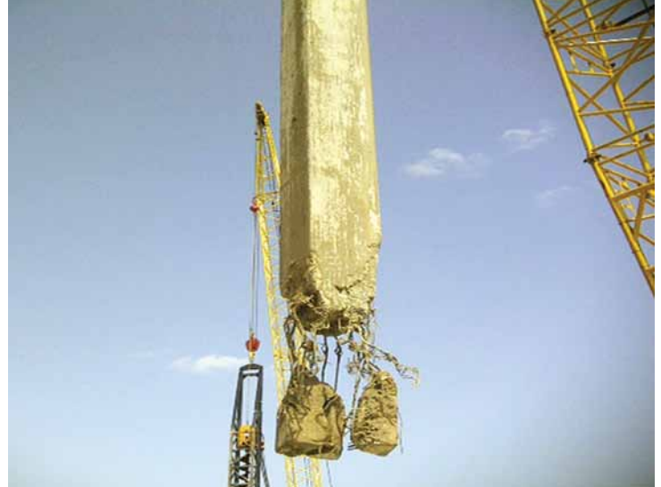
Figure B. Extracted concrete pile showing the pile damage.

to complete the foundation successfully. Since then, damage in test piles has been detected on countless construction sites in many countries by the \beta -method and verified by extraction, substantiating the original recommendations.