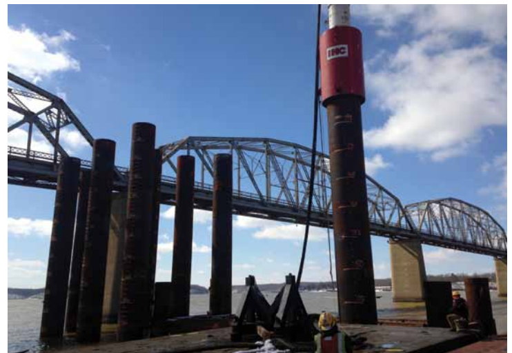
Kentucky Lakes Bridge project

Research is ongoing in many parts of the world and we all need to stay informed about progress in this important deep foundation specialty. Fortunately, dynamic testing provides a cost effective option that can be successfully implemented into many LDOEP projects.