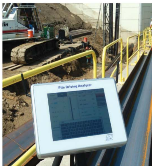
PDA-8G in use to monitor installation of driven piles on the Eastbound span of the George V. Voinovich Bridge (commonly known as Innerbelt Bridge), which spans the Cuyahoga River on Interstate 90 in Cleveland, Ohio