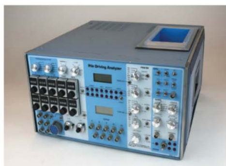
PDA from the 1980s