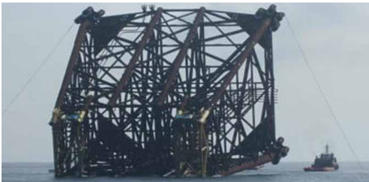
Figure 1: 8-leg jacket ready to be launched

Soil borings indicated predominantly soft to very stiff clay layers, underlain by medium dense to dense sand and sandy silt grading to dense to very dense sand.