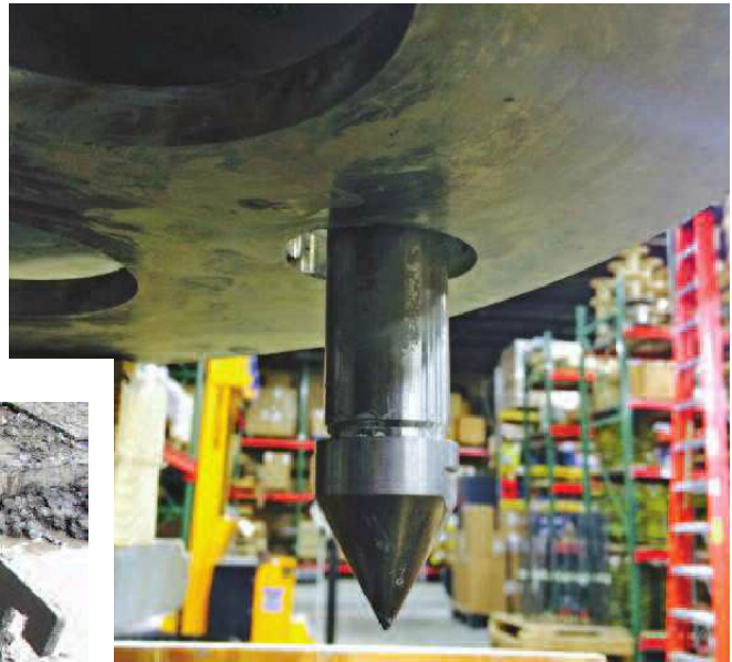
Figure 2 close-up of one of the SQUID penetrometers.

The SQUID system includes three retractable contact plates designed to exert only a low pressure (approximately 20 lb/sf) onto the bottom geomaternal. These contact plates are attached to high precision displacement transducers. The SQUID is also equipped with one 6-inch long penetrometer for each contact plate. The penetrometer cones penetrate through the debris layer and into the bearing material under the weight of the Kelly bar, and if needed under additional crowd pressure, while the contact plate remains on top of the softer material. Cone tip pressure is measured by resistance strain gages arranged in a Wheatstone