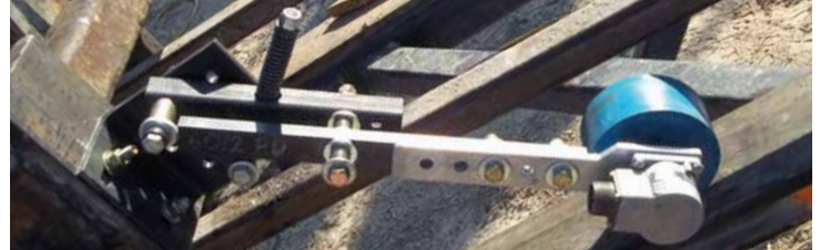
Wireless Depth Measurement Unit*