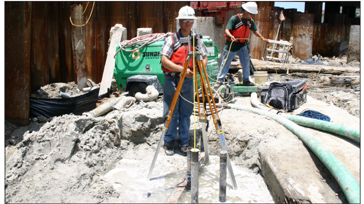
Thermal testing by probe method

Temperature measurements at the cage, obtained by either the Probe or Thermal Wire method, may also be used to evaluate concrete cover and cage alignment. The measured temperatures have an almost linear relationship to the concrete cover: if the cage is closer to one side of the excavation (less cover) its temperature is lower than average while sections closer to the shaft center will exhibit higher than average temperatures.