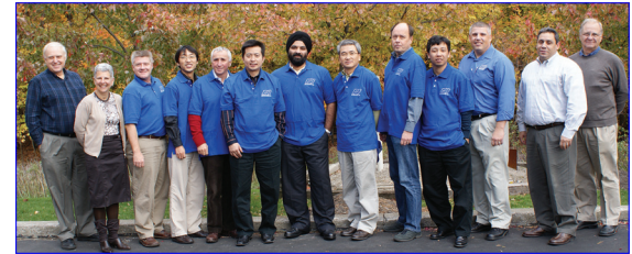
Some of Pile Dynamics international representatives, flanked by PDI staff.

In October of last year the 2008 GRL Case Dynamic Foundation Testing Seminar and Workshops attracted 90 attendees from 15 countries to Cleveland, among them several Pile Dynamics international representatives. Events included a foundation testing seminar, work-shops on PDA, CAPWAP and GRLWEAP, and field demonstrations of PDI's equipment. The international representatives also toured PDI's manufacturing facilities and received training to better serve potential customers in their respective territories.