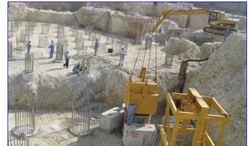
Foundations for Convention Tower, Qatar

The Council on Tall Buildings and Urban Habitat (CTBUH), the world's leading authority on tall building design and construction, designated the Shanghai World Financial Center (SWFC) the world's "Best Tall Building Overall" in 2008 at its annual awards ceremony in Chicago. The Shanghai World Financial Center is supported by steel piles that were dynamically tested with a Pile Driving Analyzer® by the Shanghai Harbour Engineering Design and Research Institute. Shanghai Harbour Engineering Design and Research Institute has been using PDI equipment since 1990.